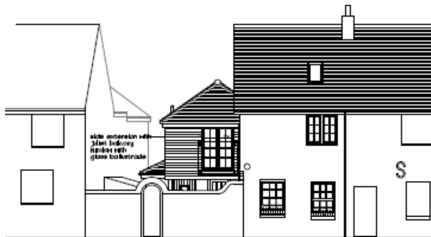
Proposed South (Street Elevation)